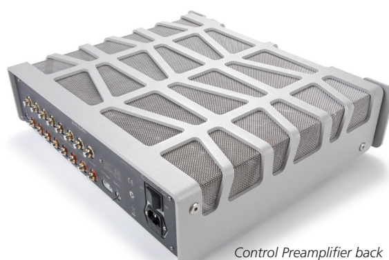
Control Preamplifier back

We believe our Control preamplifier will stand comparison with the very best available at any price. Our design is an exercise in minimalism in the service of music. At its heart is a high precision 32 step attenuator utilising non-magnetic Vishay-Dale resistors which provide fine control over the volume setting. Along with the buffer that follows, there is essentially no impact on the signal passing through. The result is pure. Just music, with nothing added, and nothing taken away.